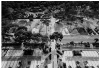
Figure 22. Atelier Coloco Tripoli Green Belt, Tripoli, Libya 2008-2009

The research center for bio-urbanism inside an abandoned sugar factory in South Taiwan, by C-LAB design studio, is a perfect example of sustainable natural integration where multifunctional education spaces are complemented with extensive community gardening and the introduction of wild plantation. All the interior walls of the building and all the windows are removed in order to grow bamboo and vegetables inside the house and the building’s roofs and rain water channels have been reorganized to harvest rainwater, while part of the ceiling has been removed in order to allow rain to fall on carefully selected areas of vegetation. According to ecological teachings the Ruin Academy hooks on to the Local knowledge of the Taipei basin and reacts on this and the design does not replace reality.