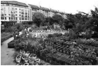
Figure 1. Nomadic Green, Prinzessinnengarten, Berlin, Germany 2009

and offers a new way of living in the city, by means of a recovery of a new relationship man/nature through agriculture [4].