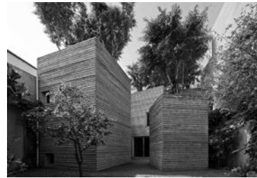
Figure 5. Vo Trong Nghia Architects, House for Trees, Ho Chi Minh City, Vietnam 2015

House for Trees is a possible answer to the rapid urbanization of cities in Vietnam. Vo Trong Nghia mentions that in Ho Chi Minh City only 0.25% of the entire metropolitan area is covered with greenery, making over the Vietnamese origins characterized by extensive tropical forests. Therefore, new generations are losing their connection with nature. The aim of the project is to re-establish it bringing green space back into the city by a tight budget (156,000 USD) intervention of housing. Trees grow on the roof of five concrete little buildings conceived as oversized pot plants, standing in a little area (226 sqm), crowded in one of the most densely populated of the city.