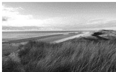
Figure 16. West 8, The new Hondsbossche Dune, The Nederland 2016

The Ugento Park, today consists of a system of dunes, basins and canals; it is the largest in the Mediterranean area of Salento. The winner of the competition project for its development foresees the insertion of floating natural islets, made with bamboo and marsh bulrush structure in the form of large creels, ideal for the formation of natural habitats for spontaneous or induced fauna restocking, integrated with activities related to sustainable tourism.