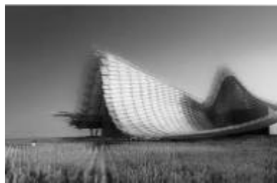
Figure 3. Yichen Lu, The Land of Hope, China pavilion, Expo Milano 2015

The healthy food issue is very sensitive in the United States. Spokesmen are internationally renowned chefs and Michelle Obama, messenger of it in her role as first lady, but the matter becomes even more interesting, especially from an architectural and moral point of view, when creating urban gardens can even avoid the “land use”.