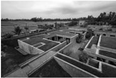
Figure 4. Kashef Mahboob Chowdhury, The Friendship Centre, Gaibandha, Bangladesh 2011

Mahboob Chowdhury designed it to provide an inviting and accessible space, to blend with the natural environment the ruins of Mahasthan, a Buddhist dwelling from the third century BC. The Centre provides educational and housing objectives and is located in an agricultural area susceptible to flooding and earthquakes. The project relies on natural ventilation and cooling, facilitated by green roofs, courtyards and pools.