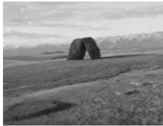
Figure 10. Ensemble Studio, Beartooth Porta, Fishtail, Montana, USA 2015

Chile), are placed in different outdoor areas at Biennale of Venice 2016 as well as in the original site, giving the visitors the chance for observation and contemplation of the landscape's and/or the architecture's beauty around them.