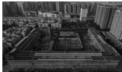
Figure 13. Jiakun Architects, West Village, Basis Yard, Chengdu, China 2014

The building, designed for 500 children of the factory's workers, is conceived as a continuous green roof, providing food and agriculture experience to children, as well as an extensive playground to the sky. On the green roof is realized an experimental vegetable garden where five different vegetables are planted in 200 square meters garden for agriculture education.