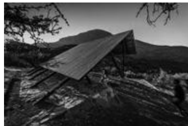
Figure 11. Elton & Léniz, Ande's shadows, San José de Maipo, Chile 2014

The Nature Culture relationship is a complex field where complex mutations happen: different universes of learning, according to the specific issues, relate to the nature and can become a learning scenario itself. The educational purpose is integrated with the architectural design, with the building practice and materials, and the whole process is part of an educational experience that calls for a cultural awareness, research, construction of a social image, and life.