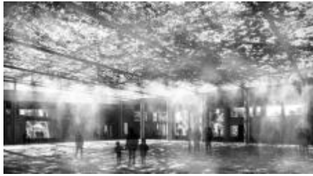
Figure 14. Toni Girones, Museum of Environment and Climate, Lleida, Spain (in progress)

protected landscape systems, the project foresees its use addressed to knowledge, environmental safeguard, enhancement.