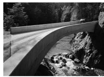
Figure 7. Marte.Marte Architects, Bridge Schanerloch, Dornbirn, Austria 2005

The bridge through the Schanerloch is part of a spectacular route to an ancient settlement area characterized by a series of natural rock tunnels and stone arch bridges. Due to modern technology the geometry of the arch, curved and twisted, is decreased to its very limits.