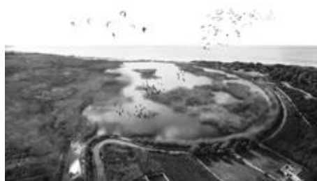
Figure 15. Plan for the Redevelopment of Coastal Landscapes, Ugento, Italy 2015

The climate is the first material of this project, where container and content coincide. A stable temperature inside a semi-built environment is a consequence of the perfect harmony man/nature and, specifically, designer/context. Taking advantage of the natural elements, the boundaries of the building dissolve in a large park that is part of the natural site, which is equally distant from the mountains (Pyrenees) and from the sea (Mediterranean coast between Tarragona and Barcelona). A new atmosphere envelops the visitors, and between light and dark, the sound of water accompanies people in an inside-outside experience.