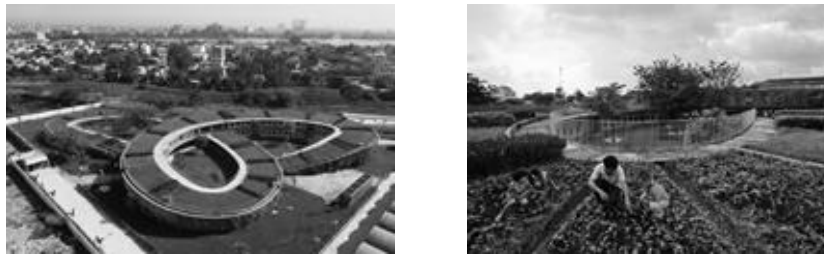
Figure 12. Vo Trong Nghia Architects, Farming Kindergarten, Biên Hòa, Dong Nai, Vietnam 2013

Vietnamese children find in this Farming Kindergarten green lands and playgrounds, thus relationship with nature, of which they were deprived by rapid urbanization.