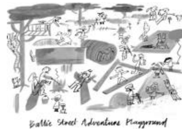
Figure 18. Assemble Studio, Baltic Street Adventure Playground, Glasgow, UK 2014

This new playground and organization in East Glasgow was realized through an on-going collaboration with the children and families of Dalmarnock (where around 54% of children live below the poverty line). It is a supervised child-led space offering free open-access play, caring adults, daily campfire food and warm and waterproof clothes to children from 6 to 12 years of age. Baltic Street offers space for children to grow in every and any direction they choose, embracing both creativity and destruction.