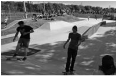
Figure 17. Rural Studio, Lions Park Skatepark, Greensboro, Alabama, USA 2009

In 2008 in the park was build a Concessions Stand and a Skatepark and after a second basketball court, a combination pee-wee football/soccer field, and a secondary social hub called the Great Lawn which is sized for 3 regulation volleyball courts. The Great Lawn is enclosed with two mounds made from the excess dirt from the football field and anchored by an existing barbecue pavilion that the students renovated. The skate park is designed utilizing earth forms in order to minimize cost of a series of concrete strips.