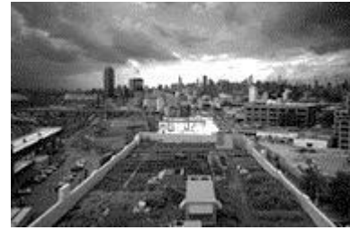
Figure 2. Brooklyn Grange, Urban farming, New York, USA 2010

Brooklyn Grange is a 2.5-acre organic urban rooftop farm in New York City. Since May 2010 it grows and distributes fresh local vegetables and hosts events and educational programming [8].