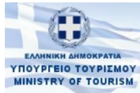
Ministry of Tourism