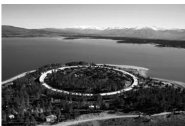
Figure 6. José María Sánchez García, The Ring, Guijo de Granadilla, Cáceres, Spain 2011

The Ring is an international center for sports innovation in the natural environment. It is a building suspended between heaven and earth in a large pristine forest that hides and protects the ruins of a Roman temple in Spain. From above architecture appears as a strong and mandatory sign, anti-organic, from below, on the contrary, it is perceived as a path traced in the landscape, and wedged open to the views of the wood and the sea. The large landscape scale is mediated by the alternation of the microscale of successive sequences of views, always the same and suddenly different for the peculiarity of the circular path.