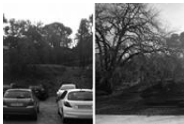
Figure 19. Toni Girones, Les Planes, Barcelona, Spain 2014

This new playground and organization in East Glasgow was realized through an on-going collaboration with the children and families of Dalmarnock (where around 54% of children live below the poverty line). It is a supervised child-led space offering free open-access play, caring adults, daily campfire food and warm and waterproof clothes to children from 6 to 12 years of age. Baltic Street offers space for children to grow in every and any direction they choose, embracing both creativity and destruction.