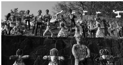
Figure 8. Nek Chand, The Rock Garden, Chandigarh, India 1957

From an intuitive reading of the place art interventions on the landscape rise. These kinds of projects propose synthetic methods and conceptual vision, sometimes hyperreal combination of Art and Nature, which weaves a relationship of mutual exchange, that is almost a dialogue. In the man/nature relationship, therefore, a third person intervenes: the artist who, with overwriting actions, enhances the characters of the place producing, on one hand, an augmented reality for those who approach this new landscape, on the other producing artistic actions and objects on a large scale.